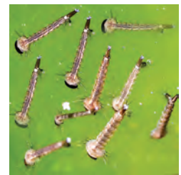
larvae seen through hand lens

Rajat: But flies don't bite. Then how do they spread diseases?