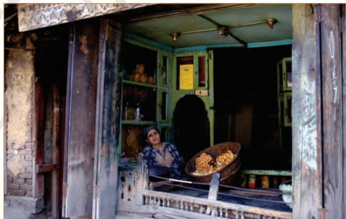
Can you tell what is shown in this picture? Every lane in Kashmir has a bakery. Kashmiri people don't cook roties in their homes, they buy it from such bakeries.

After a long journey Loner and I were about to reach Mumbai. My heart felt heavy. I also felt that my motorcycle did not want to come back. I was happy that I had learnt and experienced so many new things. I had also brought back some memories in my camera. And of course, this was not the end! Next time when Loner and I get bored of the city, we will again set out for a new journey!