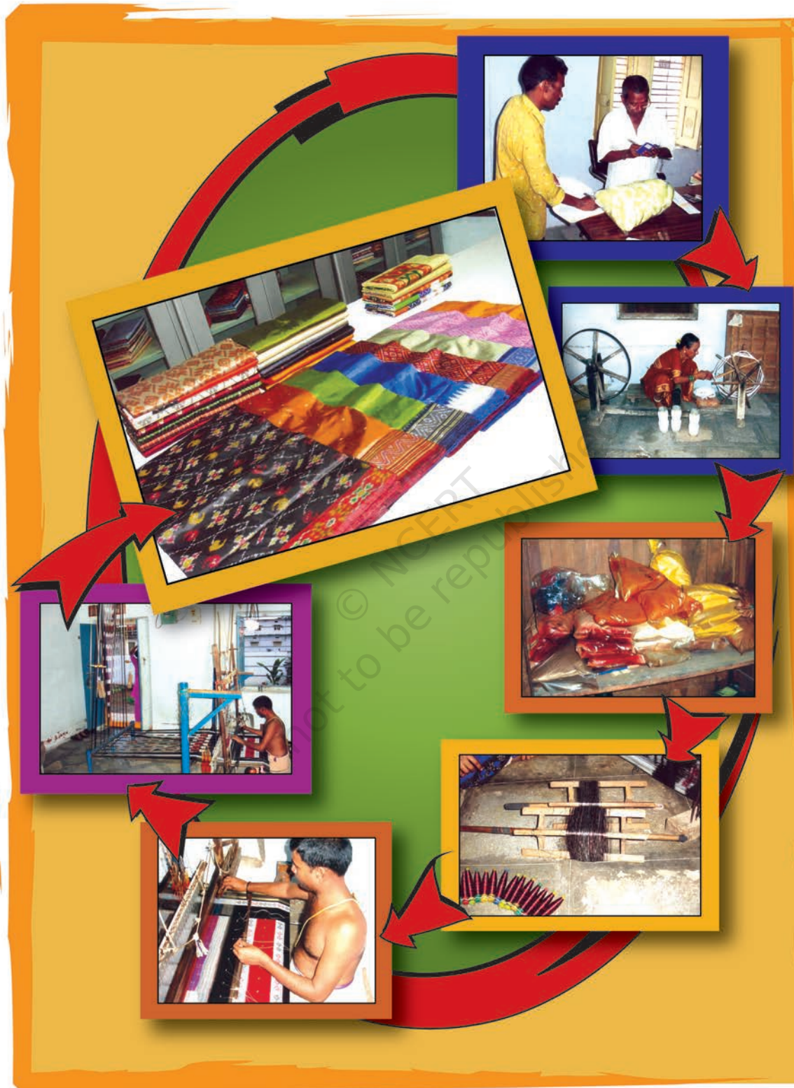
Process of making pochampalli sarees